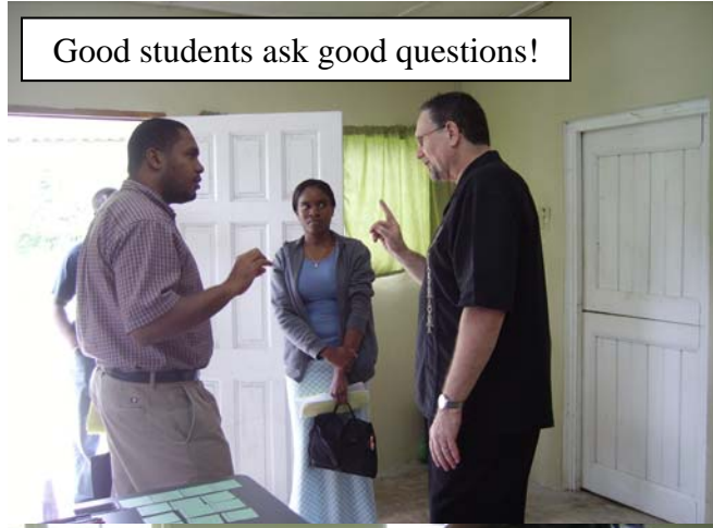
Good students ask good questions!