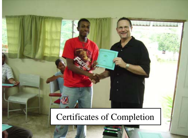
Certificates of Completion