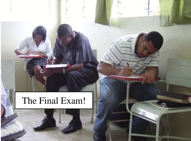
The Final Exam!