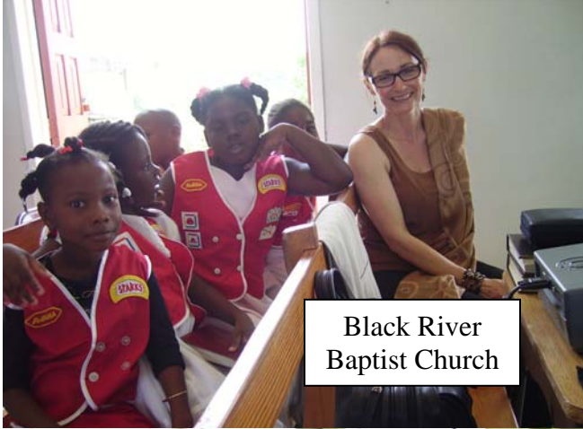
Black River Baptist Church