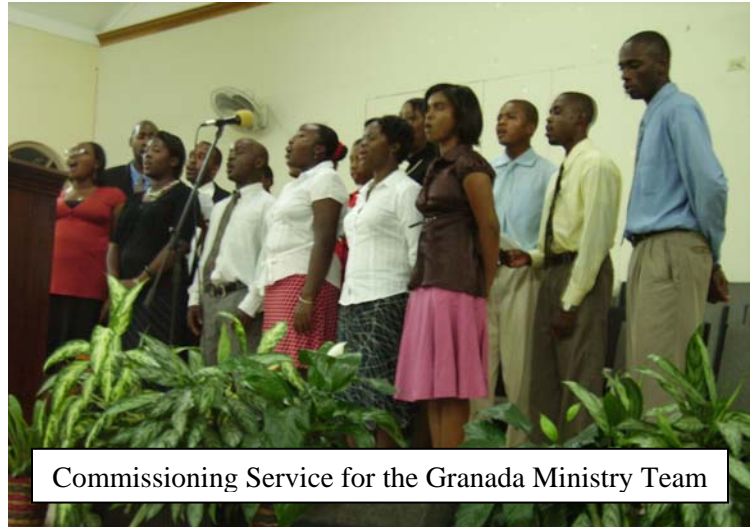
Commissioning Service for the Granada Ministry Team

What a privilege it is to teach these remarkable students. The course in Apologetics equipped them to be better defenders of the Christian faith. Many of these students are putting their new knowledge to work in a very practical way: a missionary trip! For the first time, Jamaicans will be traveling to Granada to minister the Word of God. Several of the participants are the very students we taught [picture→]. Teaching faithful men to teach others is such an effective missions model that it inspires believers to take the good news to new fields of ministry.