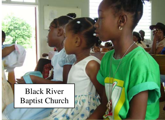
Black River Baptist Church