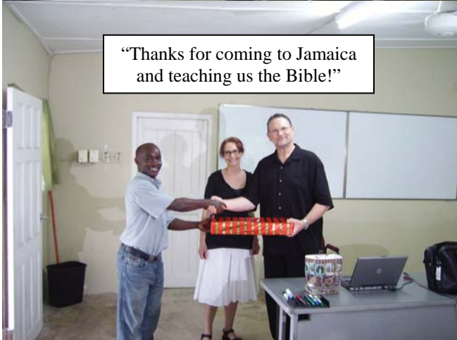
"Thanks for coming to Jamaica and teaching us the Bible!"