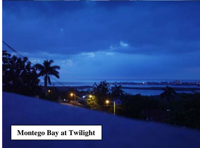
Montego Bay at Twilight