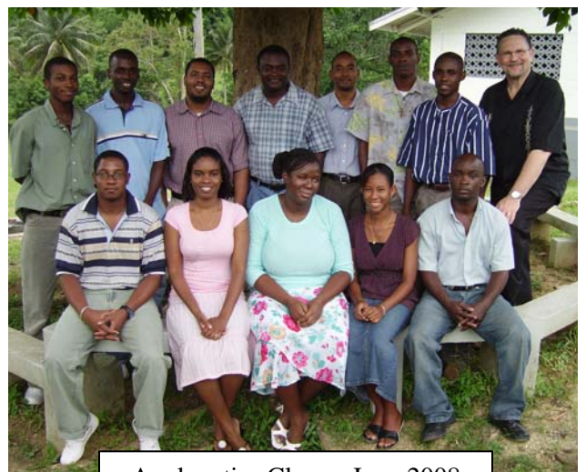
Apologetics Class – June 2008

Praise the Lord: Two of our regular supporters have decided to increase their regular monthly giving to On Target Ministry. This means that our support level has now risen to 60%. Praise God for enabling us to reach this milestone in "support-raising." We continue to be awed by how God prompts others to give so that He receives all the glory . God loves cheerful givers; we are delighted to see so many give with joy and gladness. Thank you for your faithfulness and generosity!